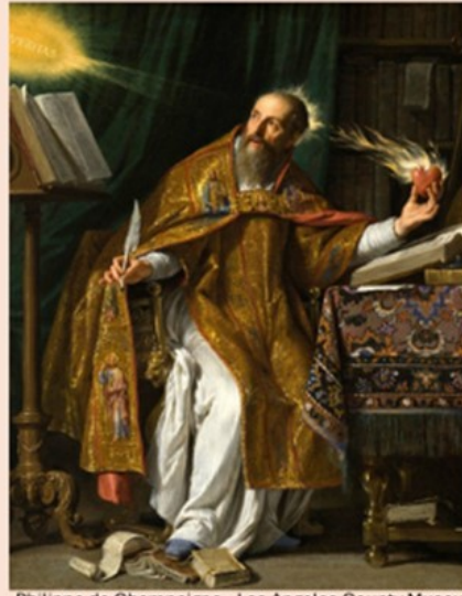
Philippe de Champaigne

To learn from St. Augustine the process of remembering who we are and the process of Christian therapy to enjoy God's peace, we shall study and analyze his Confessions , especially Book I, Chapter 1, and Book X, Chapters 5-10, 23.