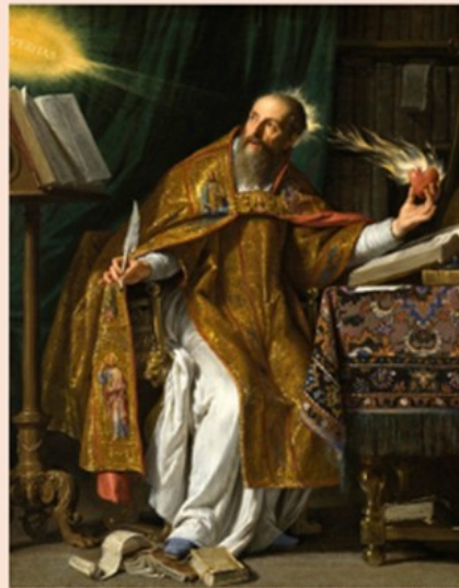
Philippe de Champaigne

To learn from St. Augustine the process of remembering who we are and the process of Christian therapy to enjoy God's peace, we shall study and analyze his Confessions , especially Book I, Chapter 1, and Book X, Chapters 5-10, 23.