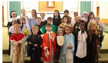
MTC First Grade Parade of Saints

Our MTC First Grade students joyfully honored the Saints in a special way this week! Each child dressed as the saint they chose to learn about and admire. After Mass, they paraded around the church, proudly showcasing their saintly costumes for friends and family.