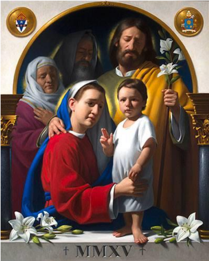
Official image of the 2015 visit of Pope Francis to Philadelphia for the World Meeting of Families. The Holy Family is pictured here in three generations: the child Jesus with his parents and grandparents.